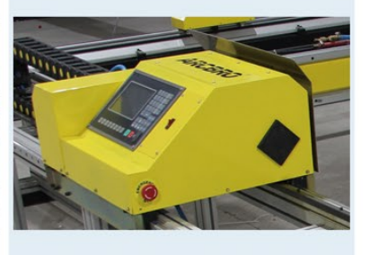
The powerful motor update, Panasonic servo system optional.